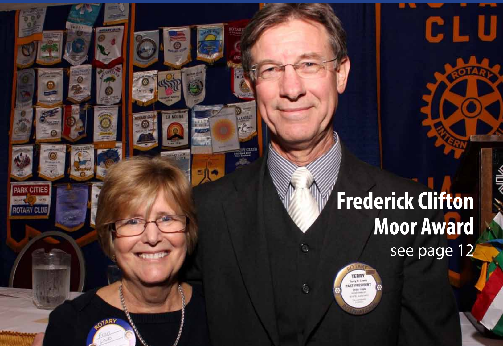
Frederick Clifton Moor Award see page 12