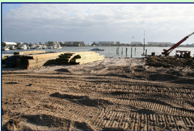
Installation of the Seawall