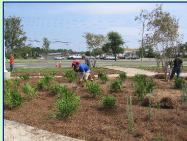
Landscaping in Progress