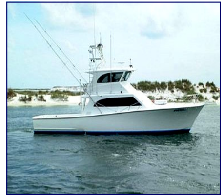
Phoenix Charter Fishing Boat

If you can't tell the difference between a Snapper, Grouper, Amberjack, Cobia or Mackerel, the Destin Charter Boat Association's website can help you identify your catch. Coming soon, they'll include action videos of these sport fish of the Em-