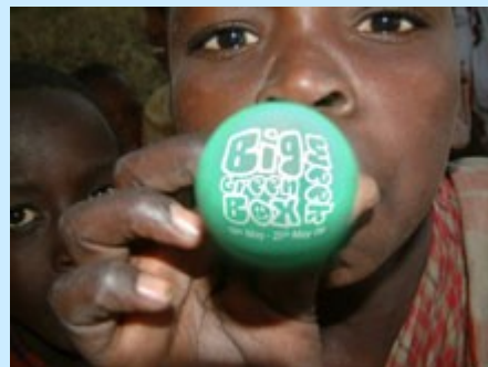
Big Green Box Week promotes Shelter Box, the grassroots relief organization best known for its big green boxes delivered to disaster sites