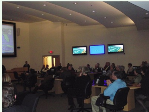
FWB Rotary in the EOC War Room- Vocation Night 3/2011