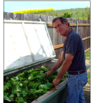
A member of the Rotary Club of Morro Bay Eco in California, USA, sets up a bin used to create compost tea for three public golf courses in San Luis Obispo. The composted food waste, landscape byproducts, and grass clipping are used instead of chemical fertilizers.

The Morro Bay Eco club received its charter on 16 June.