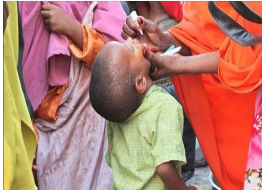
A child receives the oral polio vaccine during an immunization campaign. As of 14 August, 110 cases of wild poliovirus have been reported in the Horn of Africa.

Japan’s emergency grant will pay for more than 5 million doses of oral polio vaccine for supplementary immunization activities in November and December, expected to reach more than 2.8 million children under 10.