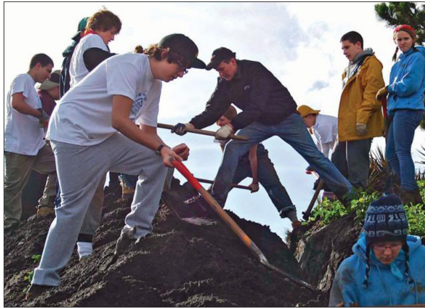
High school students from the Builders Beyond Borders program help install pipes that will carry water to the mountain town.