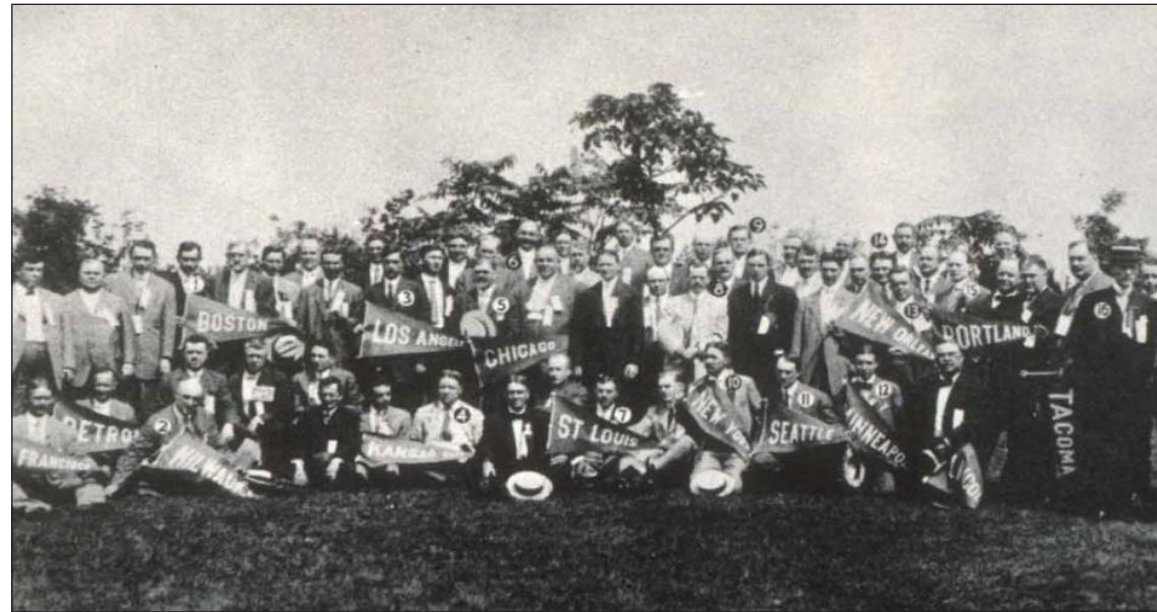
Rotary's first fiscal year began the day after the first convention ended. The convention of the Rotary Clubs of America was held in Rotary's birthplace, Chicago, in 1910.